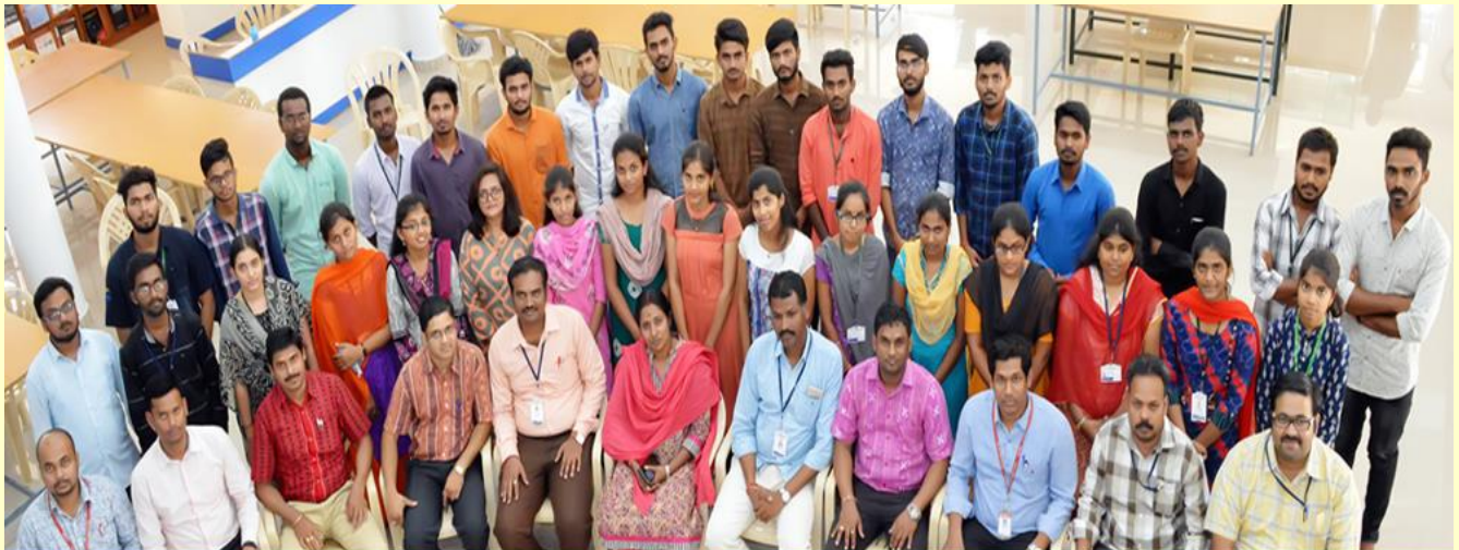
EEE Students got 51 offers in Reputed Companies through Campus Drive 2015-19 Batch.